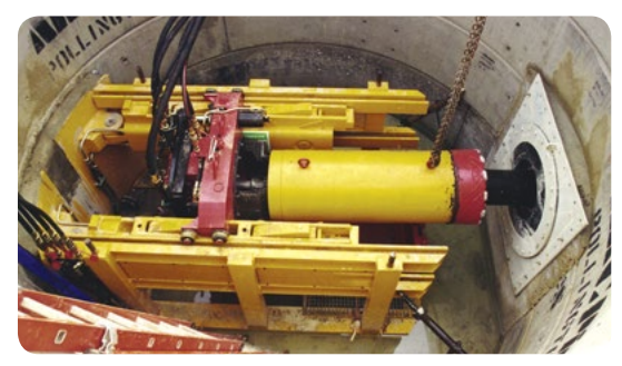
Pumps operate at pressures to 10 000 psi (700 bar) in harsh, dirty conditions on pipe jacking systems.