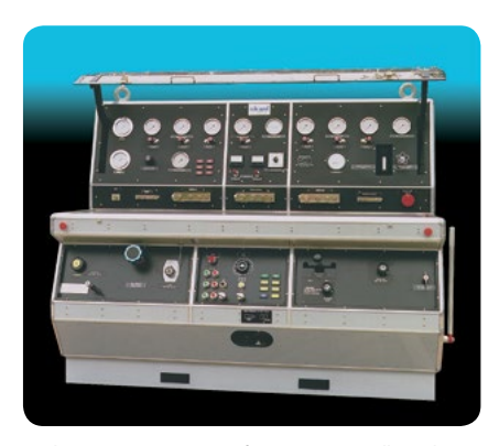
High-pressure pumps perform exceptionally with a wide range of fluids in harsh test stand applications.