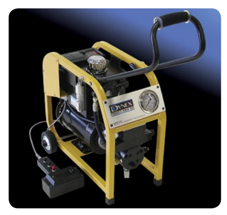
High-pressure torque tools with checkball pumps provide long life, higher speed and increased power.