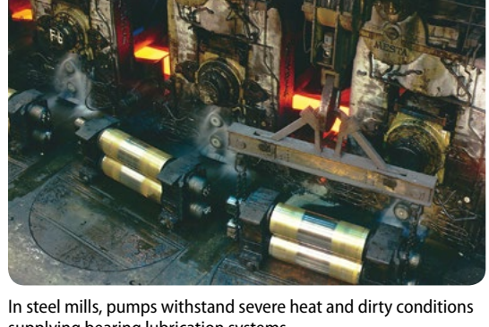
supplying bearing lubrication systems.